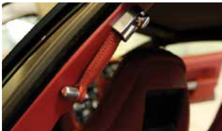
BESPOKE SOLUTION FOR ASTON MARTIN